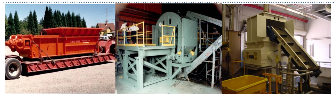
Global Recycling Systems, with the City of Stamford CT, the City of Louisville KY, Bristol Myers Squibb, GM, Boeing and 8000 other satisfied users worldwide.....

P.O. Box 399 707 North Park Street Streator, Illinois 61364 U.S.A. P815-674-5802 / F 815-673-5682