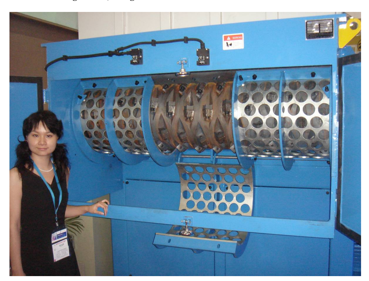
THIS IS A PICTURE SHOWING THE SCREENS WITHIN THE GRINDER THAT ARE USED TO DETERMINE THE END PARTICLE