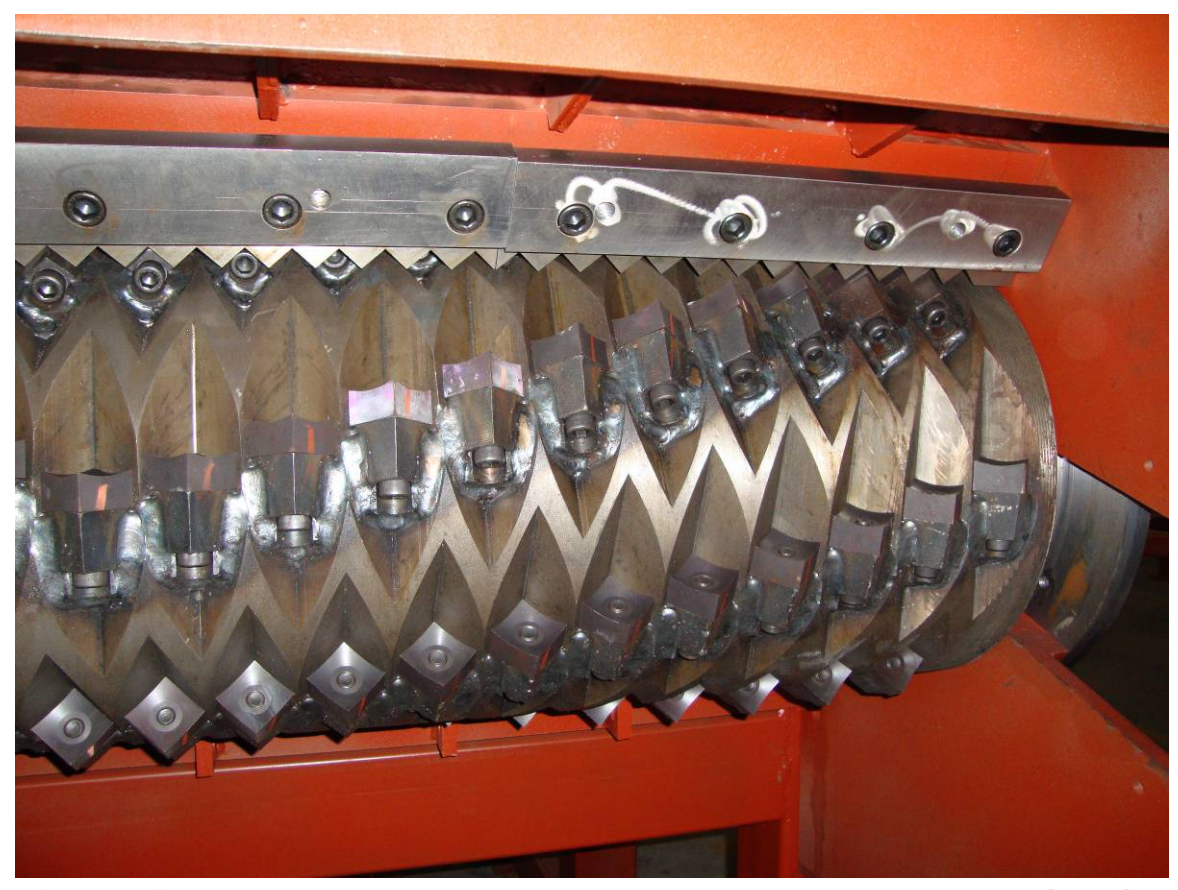
This is the rotor on our 6060 Series Unit, unit is not painted and is for sales purposes only. The unit is shown not completed.