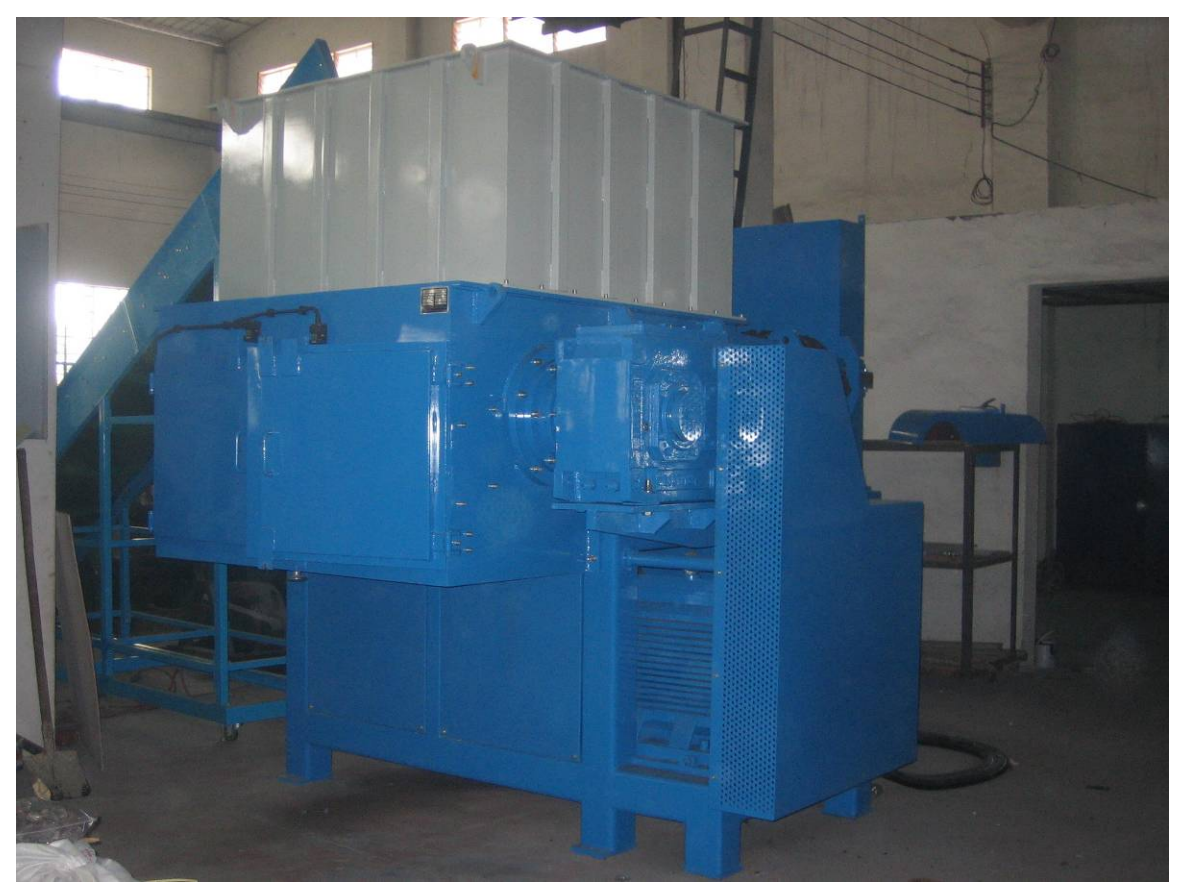
This is a 6060S Series Unit from another angle.