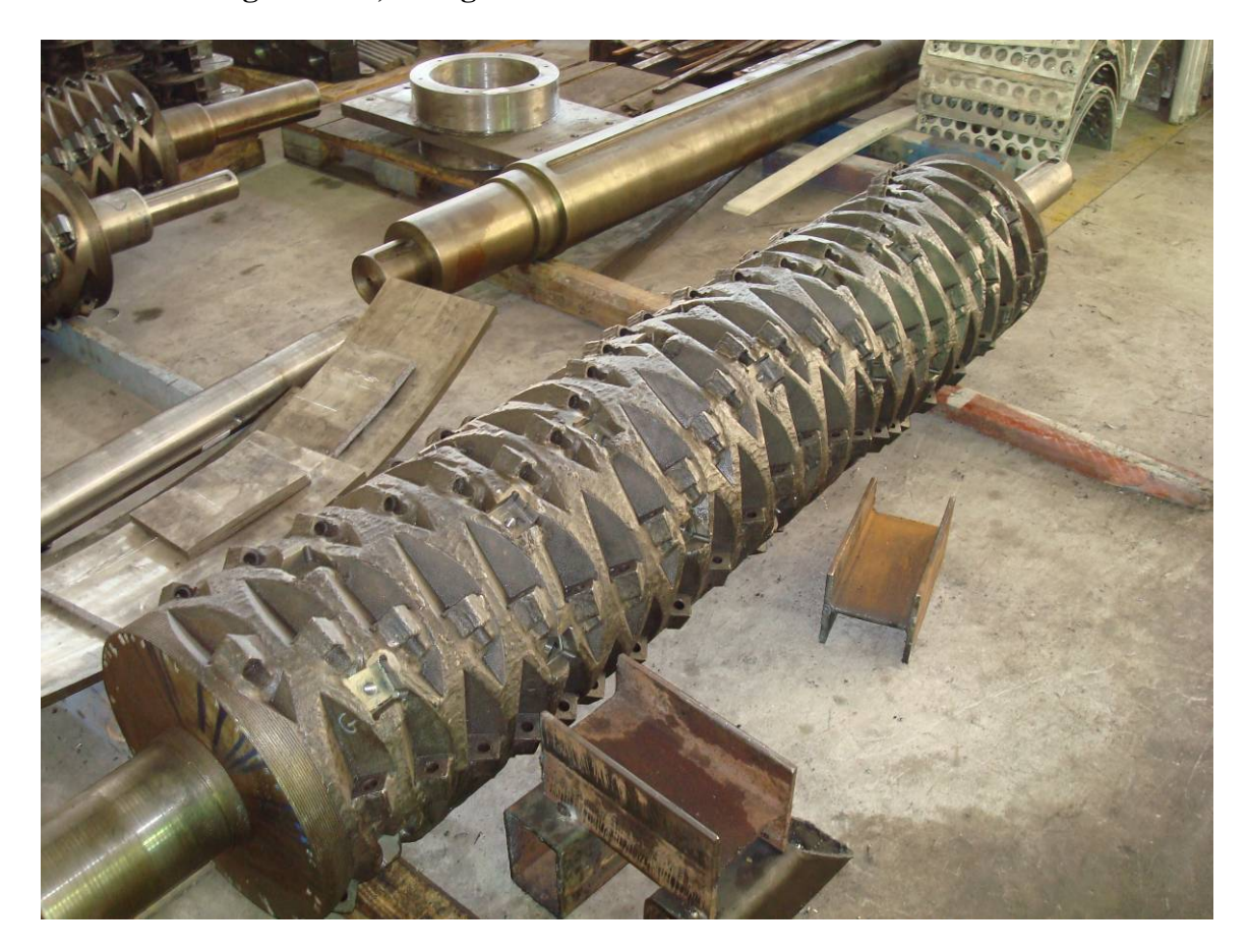
THIS IS A PICTURE OF A HARDENED ROTOR FOR USE IN APPLICATIONS WHERE ABRASION IS PRESENT SO THAT THE UNIT CAN RUN EASILY IN AN ABRASIVE ENVIRONMENT WHERE PLASTICS ARE CONTAMINATED WITH DIRT AND GRIT.